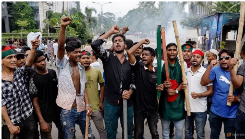
Demonstrators shout slogans after they have occupied a street during a protest demanding the stepping down of Bangladeshi Prime Minister Sheikh Hasina, following quota reform protests by students, in Dhaka, Bangladesh, Aug 4, 2024. (PHOTO: see more)

05 Aug 2024 02:19AM (Updated: 05 Aug 2024 11:51AM)