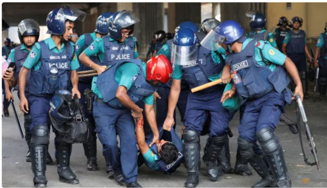
Police carry a wounded police officer during a clash between police, pro-government supporters and protesters after anti-quota protesters were demanding the stepping down of the Bangladeshi Prime Minister Sheikh Hasina at the Karwan Bazar...see more

At least eight people, including two students and a ruling party leader, were killed and dozens injured amid fierce clashes in several places in the capital, Dhaka, police and witnesses said.