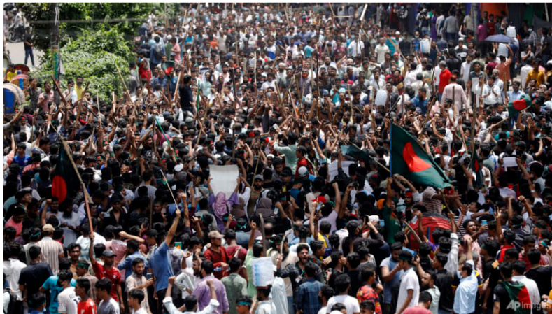
People participate in a rally against Prime Minister Sheikh Hasina and her government demanding justice for the victims killed in the recent countrywide deadly clashes, in Dhaka, Bangladesh on Aug 4, 2024.

05 Aug 2024 02:29PM (Updated: 05 Aug 2024 02:30PM)