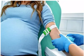
Find Fertility Clinics Near Bangladesh (See Options)

See the image you want to use. Advertisement: Tips and Tricks