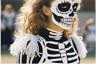
Halloween Vibes With Candy Corn, Cheerleader Camp, Crackcoo, and Creepy Classics

Advertisement: Fertility Help | Search ads