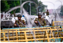
Fresh tension grips Bangladesh as student protesters demand president's resignation