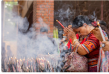
Hindus in Bangladesh celebrate their largest festival under tight security following attacks

While Bangladesh maintains development partnerships with the United States and India, it is also drawing closer to China, which is heavily engaged in the country's major infrastructure projects.