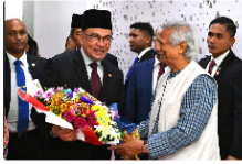
Bangladesh's interim leader seeks Malaysia's support for repatriation of Rohingya refugees