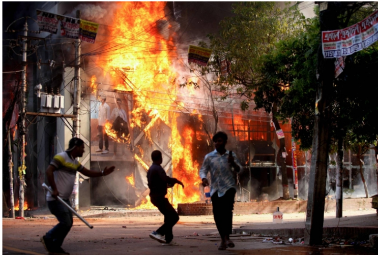
A garment store is set ablaze in Dhaka on Sunday.