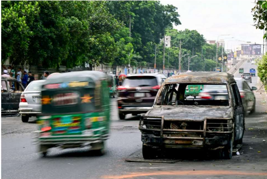
Telecommunications networks were reportedly down, with only some voice calls working in the country and no mobile data or broadband.