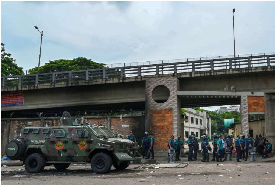
Police stand guard at the headquarters of state broadcaster Bangladesh Television.

Busy streets around the capital were deserted at daybreak on Friday but showed signs of the previous night’s mayhem, with burned vehicles and bricks thrown by protesters strewn across the roads.