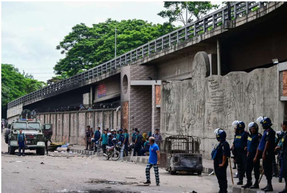
Police said that if the destruction continued they would "be forced to make maximum use of law".