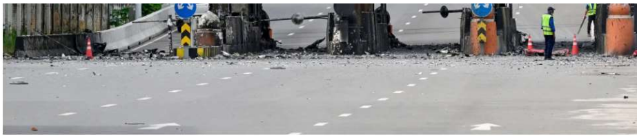
People woke on Friday to survey the destruction left by the deadliest day of the continuing student protests so far.