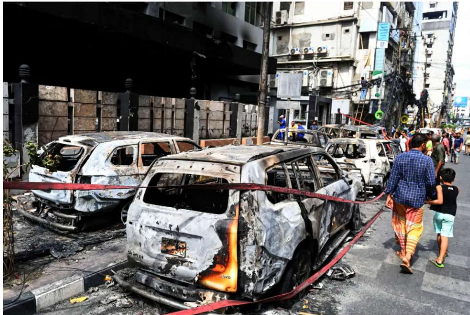
People walk past burned vehicles after students set them on fire amid the continuing anti-quota protests in Bangladesh's capital, Dhaka.

Student protests against quotas for government jobs have escalated into the country's worst unrest in years.