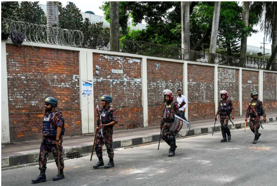
At least 26 districts around the country reported clashes on Thursday, Independent Television reported.