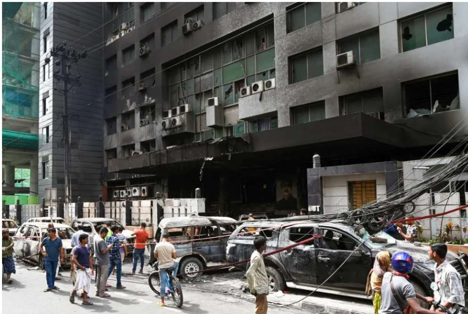
The network said more than 700 people had been wounded throughout the day, including 104 police officers and 30 journalists.