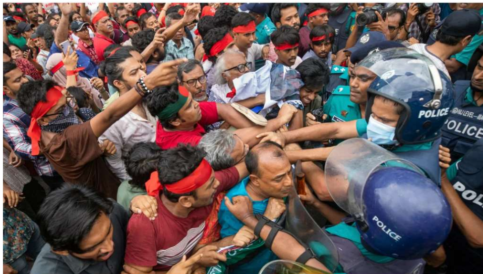
Activists clash with police during a protest in Dhaka, Bangladesh, on July 30, 2024.

(CNN) — Bangladesh on Thursday banned the Jamaat-e-Islami party, its student wing and other associate bodies as “militant and terrorist” organizations as part of a nationwide crackdown following weeks of violent protests that left more than 200 people dead and thousands injured.